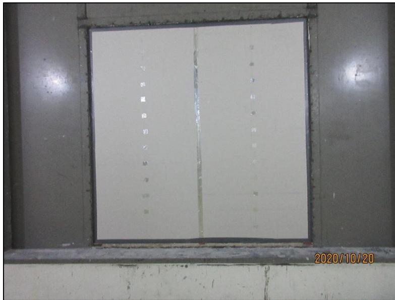
Photo No. 1 Receive Room View of Installed Specimen