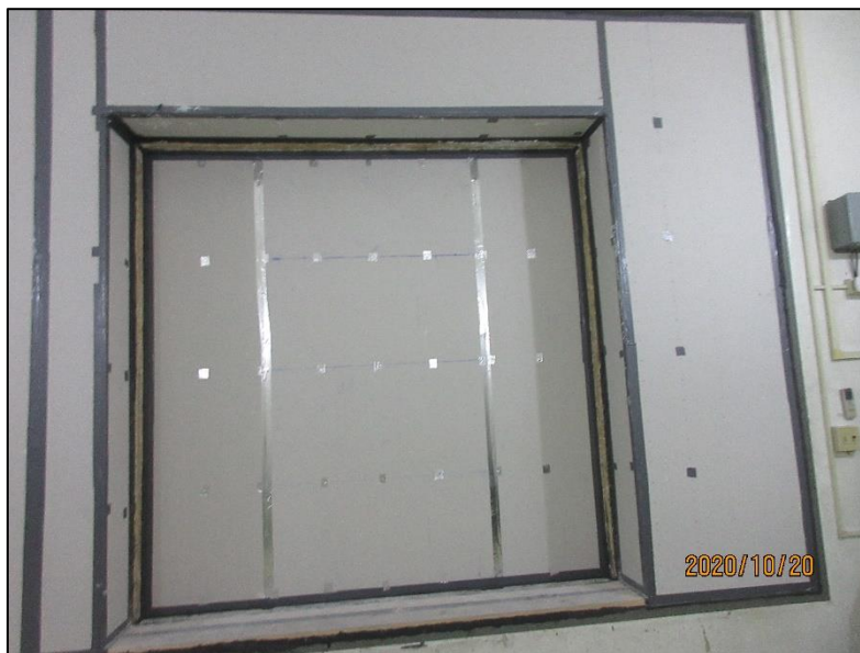
Photo No. 2 Source Room View of Installed Specimen