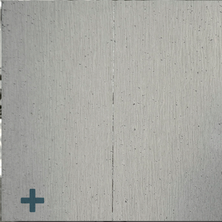
SURFACE RUST 240 HOURS DIAMONDPLUS®