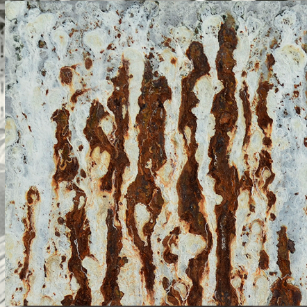
SURFACE RUST 240 HOURS G40