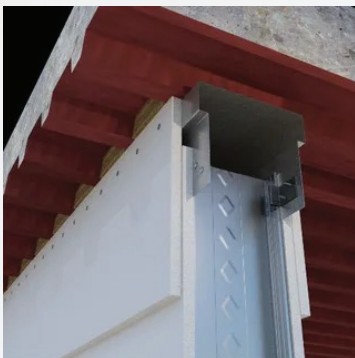
ClarkDietrich BlazeFrame RipTRAK is the only UL tested fire-rated head of wall joint system that offers an alternate listing by eliminating castle cuts and sealant in fluted deck assemblies and that meets UL 2079, 5th edition.

A rip track assembly can accommodate up to a 4-inch deflection joint, which is often required in large data center facilities.