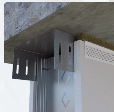
The UltraTRAK slotted system utilizes a slotted deflection track in conjunction with ClarkDietrich UltraBEAD to provide a 1- or 2-hour rated assembly for a 3/4" max joint and is UL 2079-Fifth Edition compliant.